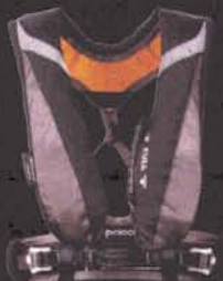
Deck Pro with Lifejacket