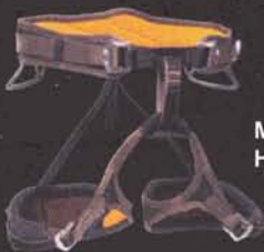
Mast Pro Harness