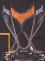
Deck Pro Harness

This may become known as the 'democracy edition' of Seahorse : first the web-driven Flying Tiger (page 45), now the Onyx 28, which has been created by and initially for a small and knowledgeable group of Swiss sailors